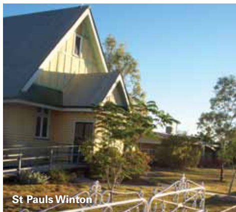
St Pauls Winton

catastrophe of the beef industry has come. An already familiar sight is that of graziers who can no longer afford the luxury of road transport walking their cattle to the sales. Recently one grazier 'drove' his cattle a hundred miles to the Winton sale. It's not surprising that over 1,000 people have left the area in the past year.