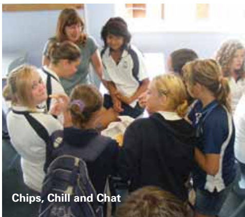
Chips, Chill and Chat

We have been warmly welcomed into Bowring School. We started the year with an egg and bacon breakfast for all - nothing like food to break the ice! We built relationship with the kids and staff by helping in the classrooms and having the recess kids' club. The Principal has an idea that she would like us to help with in 2011 working with the older students and community members on a history project, this, we feel, will be a great way to