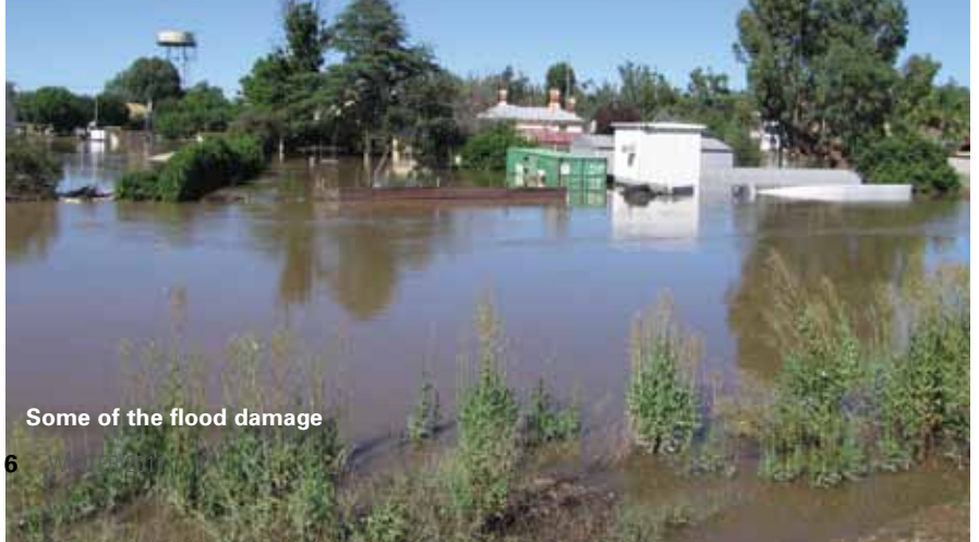
Some of the flood damage