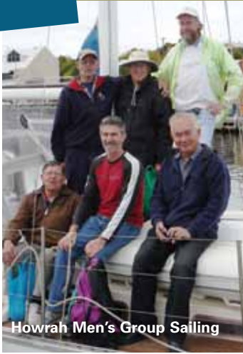
Howrah Men's Group Sailing

This story is a "faith confirming" one for me. When I read it - I am there. I feel the wet, the cold and the fear. It is written with great authority of matters maritime. It is this clarity and accuracy that leads me to