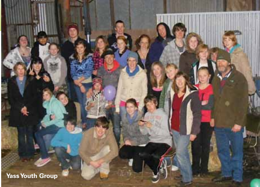
Yass Youth Group

and not easy for a temporary Principal to agree to anything long term for the chaplain/schools worker role. We began the year by assisting with a reading program for the youth at risk boys, and assisting in the classrooms and chilling out in the playground with them. I took a back seat for terms 3 and 4 while the school was seeking to fill the Principal's position. Our goal is to run a Christian based kids club in 2011 now the new Principal is established.