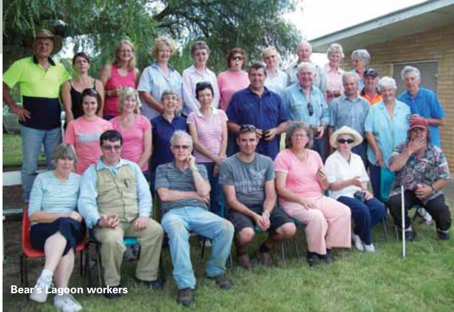
Bear's Lagoon workers

has presented a problem. A toxic mould which mimics the symptoms of pneumonia has developed, spreading to places that were not directly damaged by floodwaters. Salinity also presents a long-term problem for farming in the region.