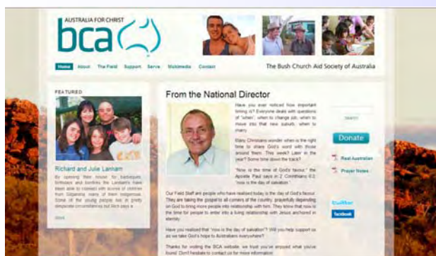
2009 saw the launch of the new BCA website