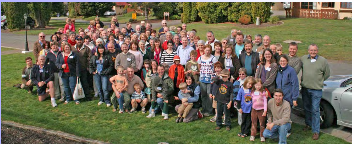
BCA Staff Conference 2008